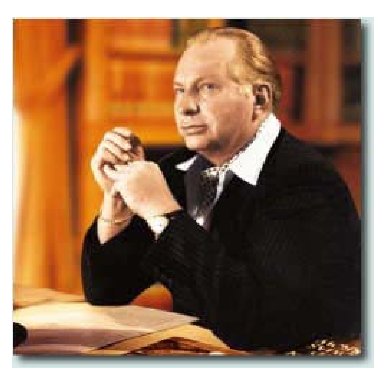
Copyright © 20010. ALL RIGHTS RESERVED International Freezone Association Inc